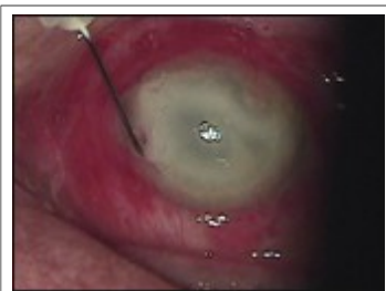
Figure 1. Endophthalmitis with an opacified cornea.

Every single case can benefit from the endoscope. Begin with routine cases in which you have clear visibility so that you can learn correct orientation and position of the endoscope within the eye. Pseudophakic patients are preferred for initial cases, but this is not critical. As with learning any new technology, use it often and in cases in which it is not essential. This will allow you to be prepared for cases in which it is the only visualization method. This strategy was best exemplified in my early experience with endophthalmitis vitrectomy cases. In my first year with the endoscope, I found it to be minimally helpful in a case of